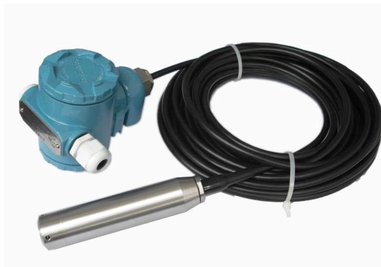
Submersible level transmitter selection specification sheet

Mainly used in urban water supply and drainage, reservoirs, rivers, oceans, oil storage tanks and oil, chemical, power plant and other departments of the water level and its open container liquid measurement, which is the ideal liquid level transmission in the industrial process inspection and control system of industrial and mining enterprises meter.